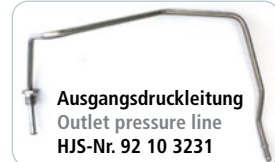
Ausgangsdruckleitung Outlet pressure line HJS-Nr. 92 10 3231

If necessary, the outlet pressure line must be replaced for installation. This must be ordered separately: