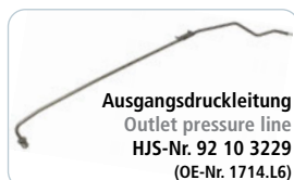
Ausgangsdruckleitung Outlet pressure line HJS-Nr. 92 10 3229 (OE-Nr. 1714.L6)

If necessary, the outlet pressure line must be replaced for installation. This must be ordered separately: