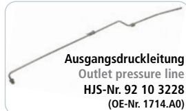
Ausgangsdruckleitung Outlet pressure line HJS-Nr. 92 10 3228 (OE-Nr. 1714.A0)

If necessary, the outlet pressure line must be replaced for installation. This must be ordered separately: